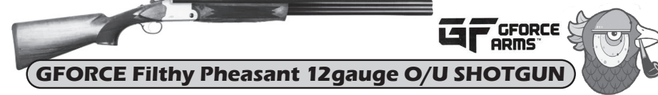
GFORCE Filthy Pheasant 12gauge O/U SHOTGUN

Tickets Prices: $10 each • LIMITED TO 300 TICKETS SOLD